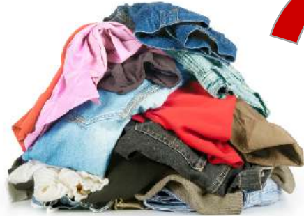
2 kg clothing

For example, we process on average per piece of furniture: