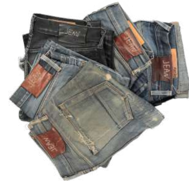
2 kg denim