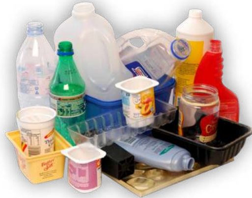
20 kg recycled plastic