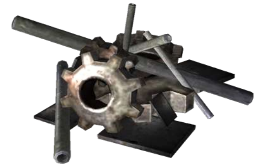
4 kg metal cutting waste